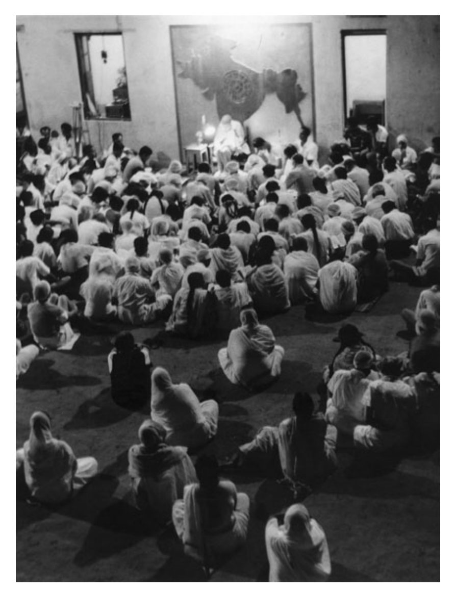
The Mother taking a class at the Playground, 1954