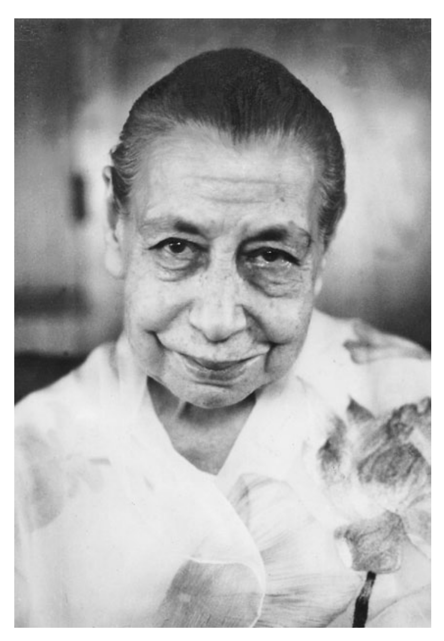
The Mother in 1969