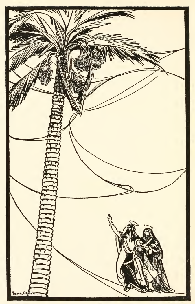
THEY HAD CAUGHT SIGHT OF THE PALM AND OASIS AND HASTENED THITHER