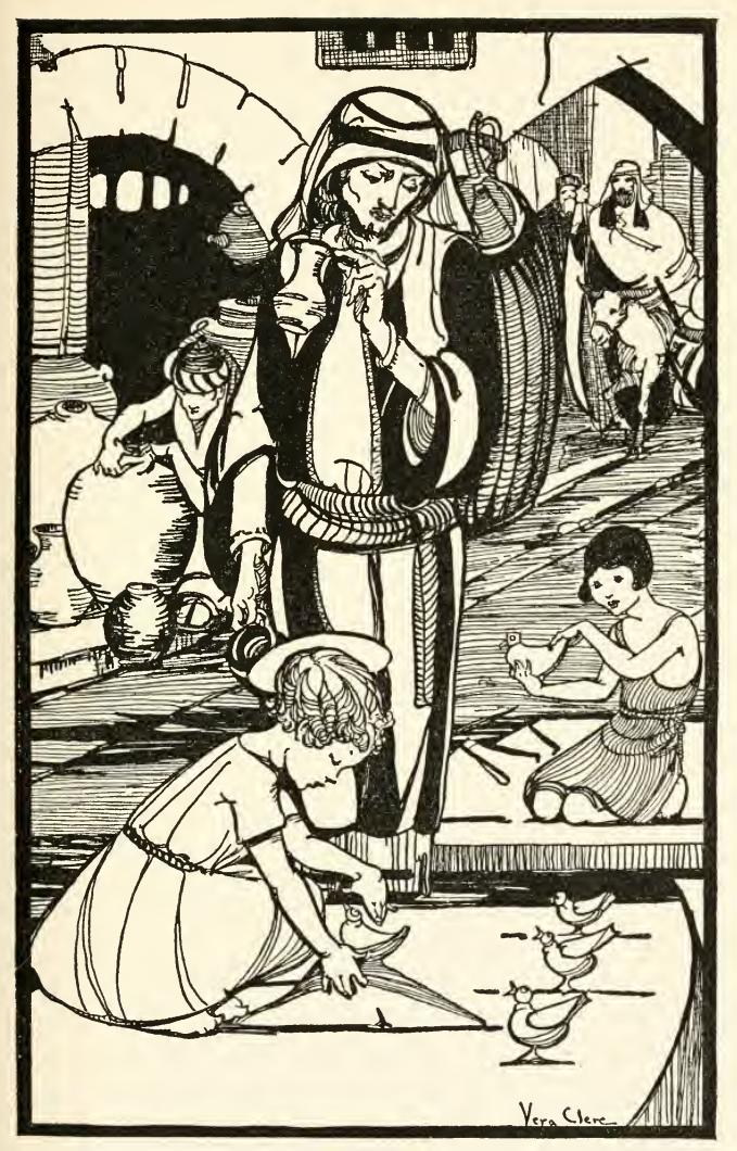
JESUS SAT ON THE DOORSTEP AND MADE CLAY CUCKOOS