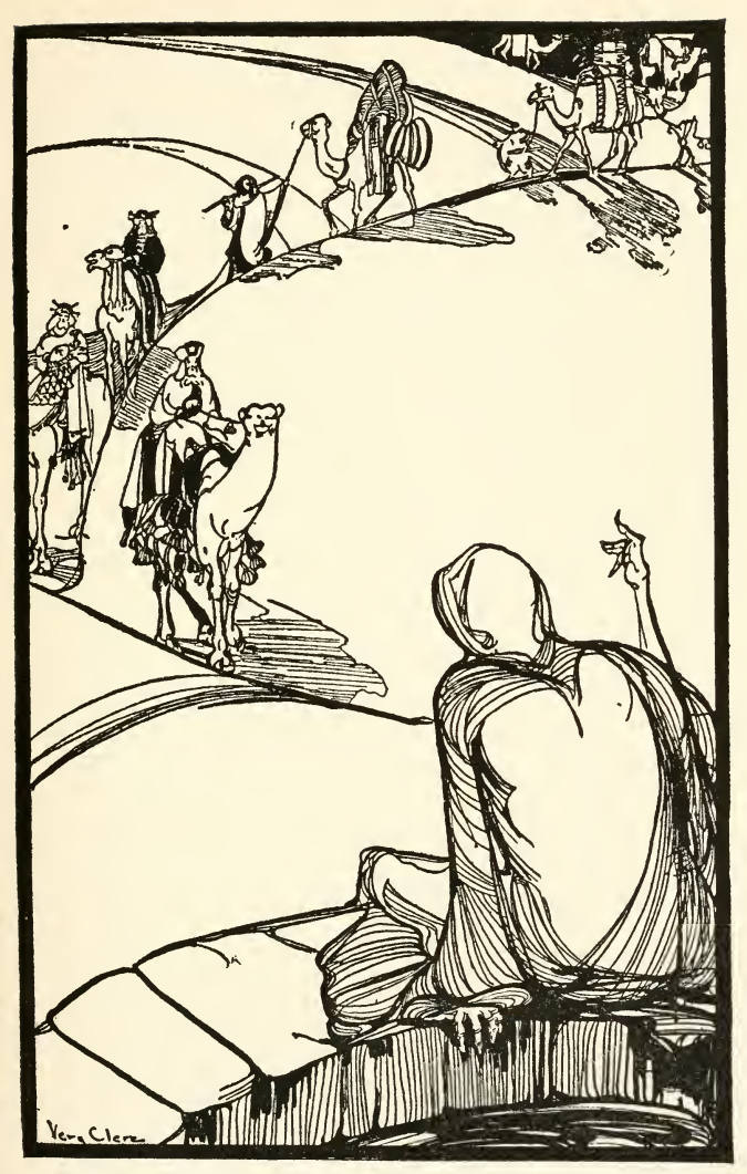
THE DROUGHT SAW A GREAT CARAVAN COME MARCHING TOWARD THE HILL