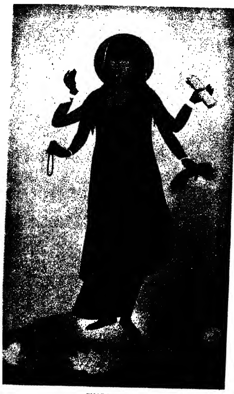
BHARAT MATA by Abanindranath Tagore