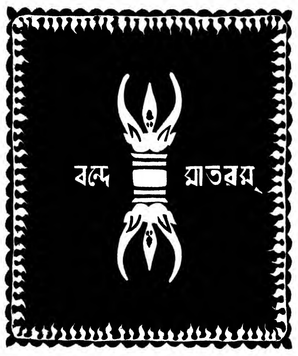
The National Flag designed by Sister Nivedita and embroidered by her pupils. It was displayed in the Congress Exhibition in 1906