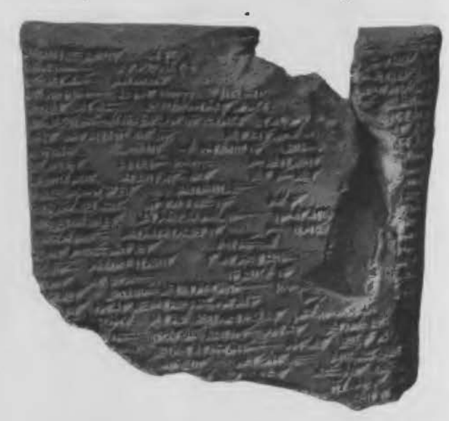
Portion of a tablet inscribed in Assyrian with a text of the Fifth Tablet of the Creation Series. [K. 3567.]