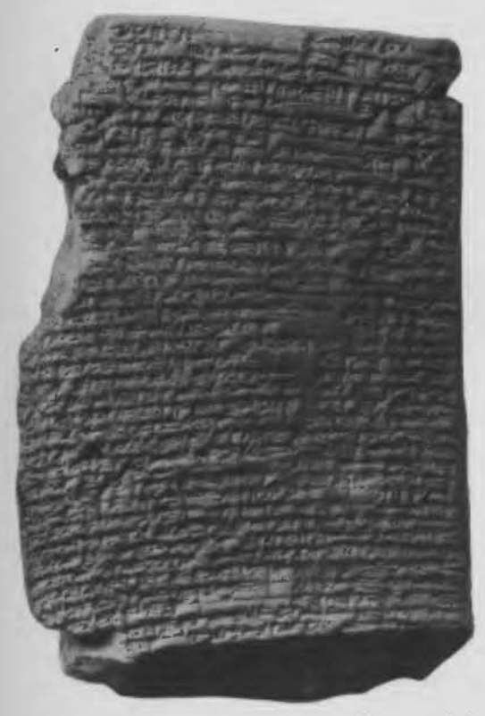
Portion of a tablet inscribed in Assyrian with a text of the Second Tablet of the Creation Series. [No. 40,559.]