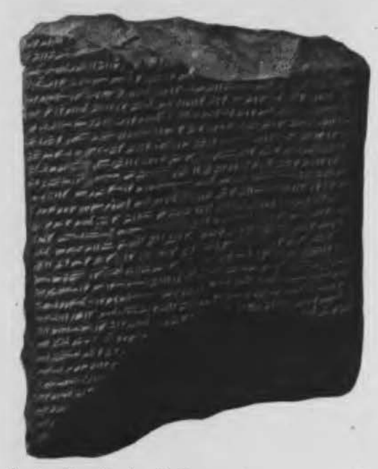
Portion of a tablet inscribed in Assyrian with a text of the Seventh Tablet of the Creation Series. [K. 8522.]