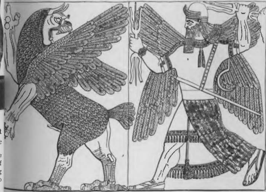
King of Assyria, 885-860 B.C., at Nimrûd. [Nimrûd Gallery, Nos. 28 and 29.]

In the consultation which took place between Arsú and TIÂMAT, their messenger MU-UM-MU - + * TIII * took part; of the history and attributes of this last-named god nothing is known. The result of the consultation was that a long struggle began between the demons and the gods, and it is clear that the object of the powers of darkness was to destroy the light. The whole story of this struggle is the subject of the Seven Tablets of Creation. The gods are deifications of the sun, moon, planets and other stars, and Apsil, or Chaos, and his companions the demons, are personifications of darkness, night and evil. The story of the fight between them is nothing more nor less than a picturesque allegory of natural phenomena. Similar descriptions are found in the literatures of other primitive nations, and the story of the great fight between Her-ur, the great god of heaven, and Set, the great captain of the hosts of darkness, may be quoted as an example. Set regarded the "order"