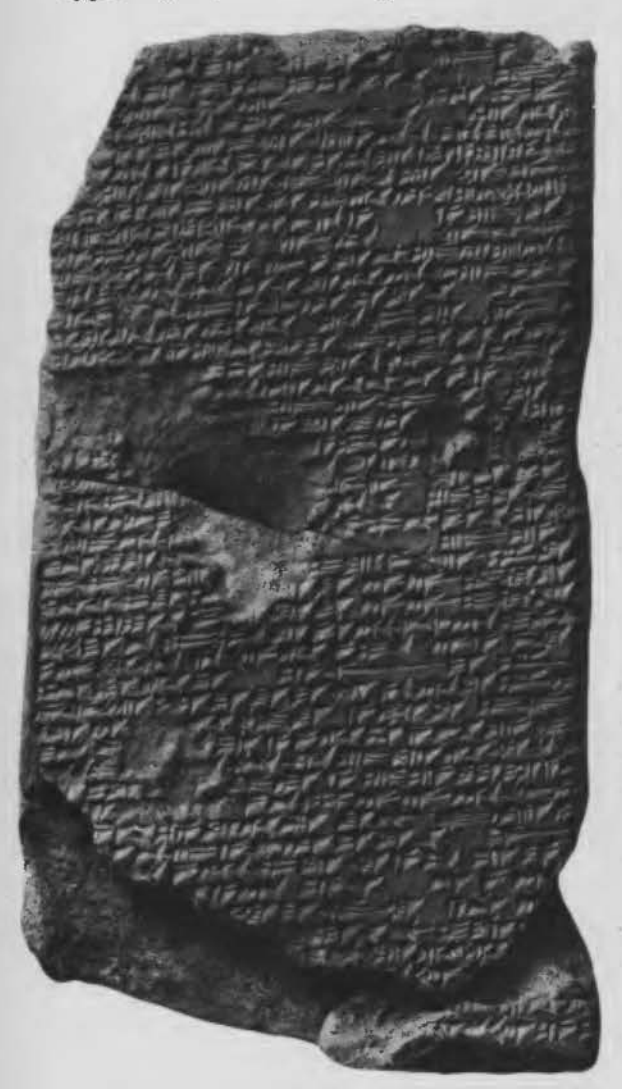
Portion of a tablet inscribed in Assyrian with a text of the Fourth Tablet of the Creation Series. [K. 3437.]