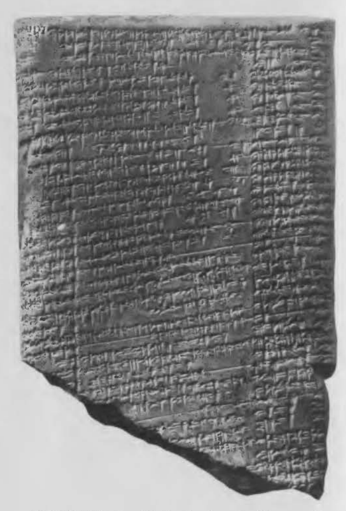
The Bilingual Version of the Creation Legend. [No. 93,014.]