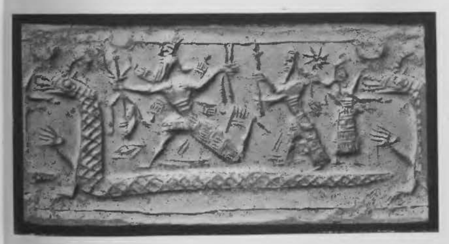
Marduk destroying Tiâmat, who is here represented in the form of a huge screent. From a seal-cylinder in the British Museum. [No. 89,589.]

Both the source of the original form of the Legend of the Fight between Ea and Apsu, and Marduk and Tiâmat, and the period of its composition are unknown, but there is no doubt that in one form or another it persisted in Mesopotamia for thousands of years. The apocryphal book of "Bel and the Dragon" shows that a form of the Legend was in existence among the Babylonian Jews long after the Captivity, and the narrative relating to it associates it with religious observances. But there is no foundation whatsoever for the assertion which has so often been made that the Two Accounts of the Creation