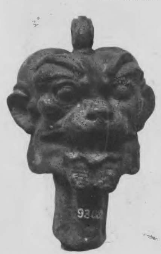
Babylonian Demon. [No. 93,089.]

"There was a time in which there existed nothing but darkness " and an abyss of waters, wherein resided most hideous beings, which "were produced on a two-fold principle. There appeared men, some " of whom were furnished with two wings, others with four, and with