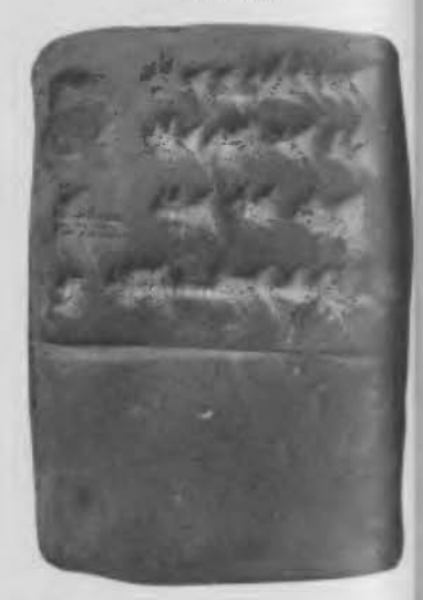
Tablet inscribed with a list of the Signs of the Zodiac. [No. 77,821.]

possessed lists of the fixed stars, and drew up tables of the times of their heliacal risings. Such lists were probably based upon very ancient documents, and prove that the astral element in Babylonian religion was very considerable.