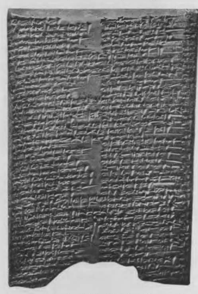
Portion of a tablet inscribed in Babylonian with a text of the Fourth Tablet of the Creation Series. [No. 93,016.]