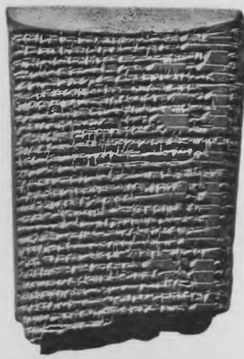
Portion of a tablet inscribed in Assyrian with a text of the Third Tablet of the Creation Series. [No. 93,017.]