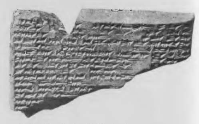
Portion of a tablet inscribed in Assyrian with a text of the First Tablet of the Creation Series. [K. 5419c.]